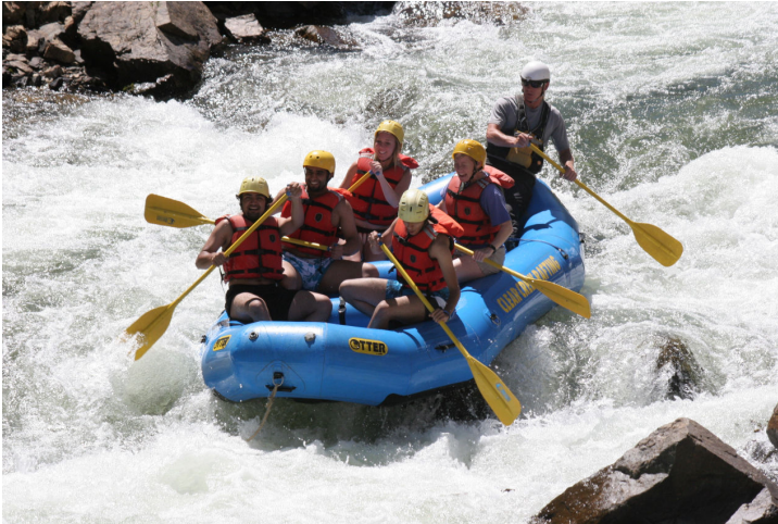
River Rafting was an exciting activity for Vacation English and intensive program students July 14 at Idaho Springs.

Spring International's annual summer 2010 writing competition produced a number of excellent essays from the beginning through advanced levels. Instructors judged the writing and chose the best from each level to receive prizes.